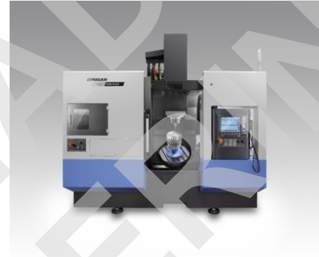
TABLE SIZE 630mm DIAMETER WEIGHT 500kg MAX WORKPIECE ENVELOPE 730mm DIA x 500 HEIGHT

X 650 A (TABLE TILT) 150° (+30/-120) Y 765 C (TABLE ROTATION) 360° Z 520 SPINDLE NOSE TO TABLE TOP 210 TO 730mm